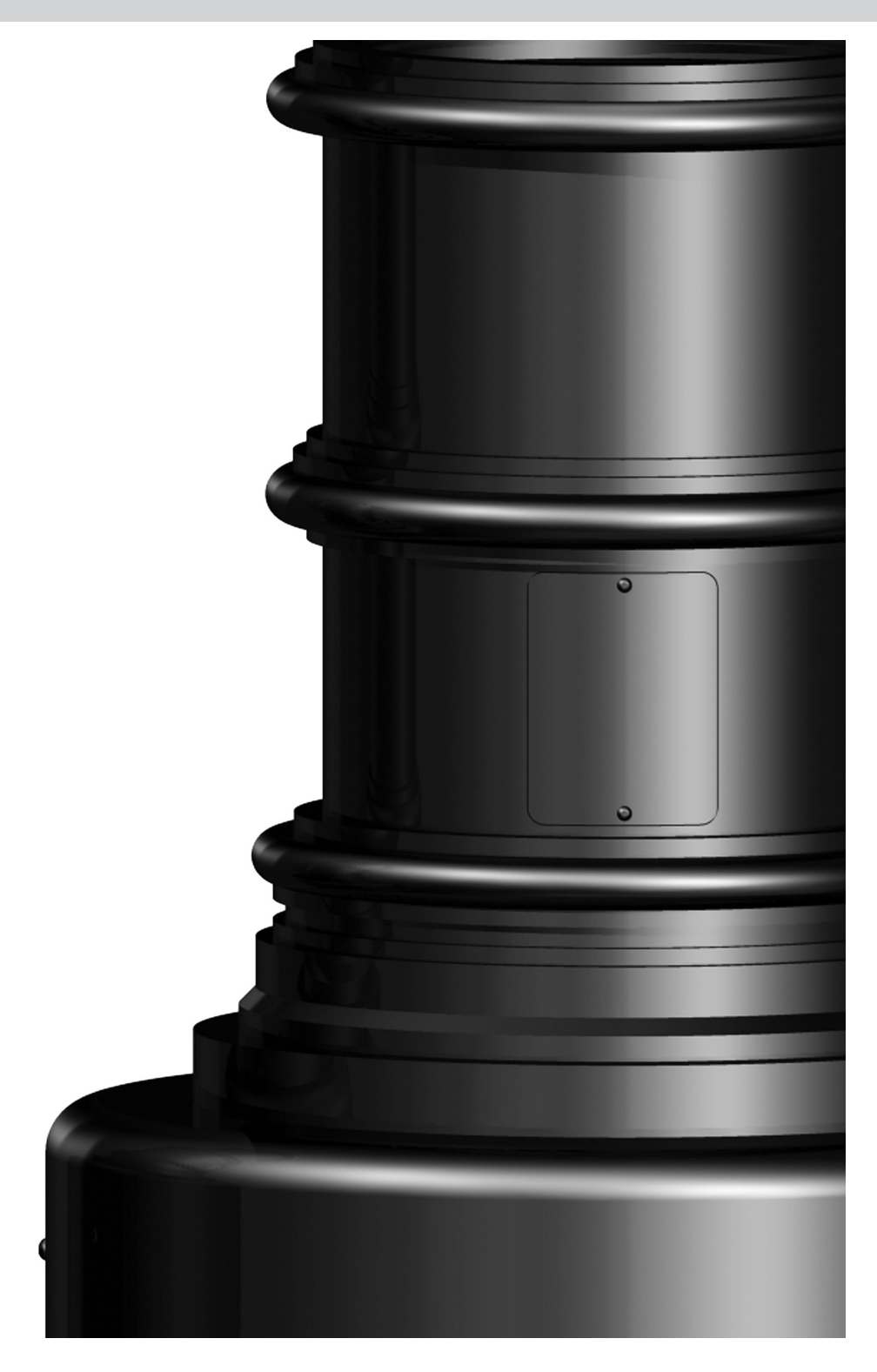
SPC7260 02/10 valmontstructures.com carries the most current spec information and supersedes these guidelines.