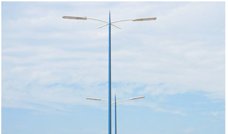
(LEFT & TOP) STREET LIGHT POLES INSTALLED AT HYDERABAD OUTER RING ROAD; (BOTTOM) STREET LIGHT POLES INSTALLED IN GOA