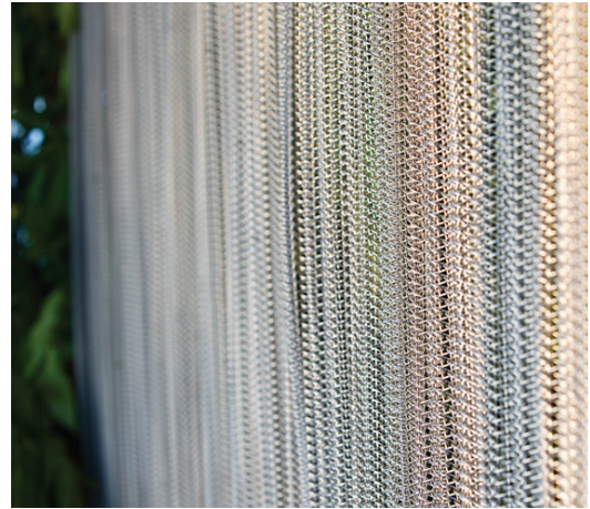
* Typical Architectural Facade Installation