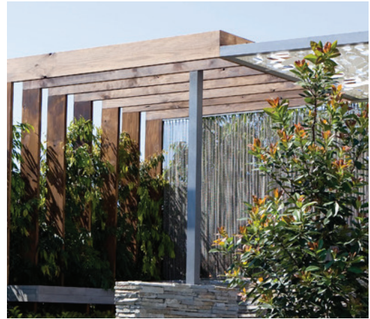
* Typical Architectural Facade Installation