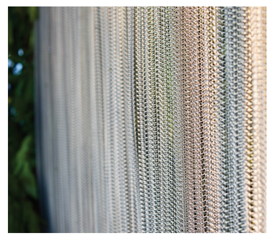
* Typical Architectural Facade Installation