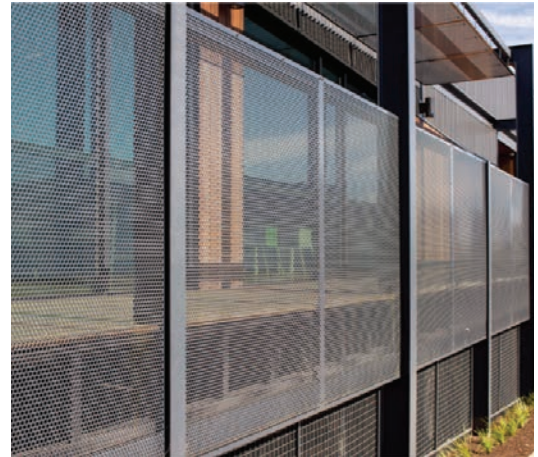
* Typical Architectural Facade Installation