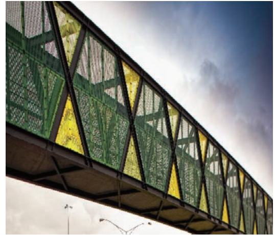
* Typical Architectural Facade Installation