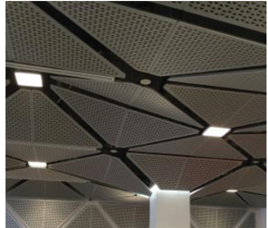
* Typical architectural facade installation of a perforated metal panel with varying hole sizes.