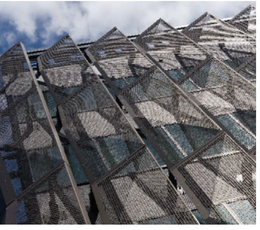
* Typical architectural facade installation of a perforated metal panel with varying hole sizes.