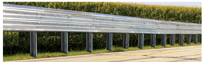
Comparison of Ezy-Guard Deflections at 2m Post Spacing