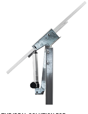
THE IDEAL SOLUTION FOR: Distributed Generation Projects Utility-Scale Projects

International, Bankable Product Portfolio | The Convert-1P Single-Axis Solar Trackers have been deployed in 11 countries on four continents, generating nearly 3GW for leading customers, financiers and partners.