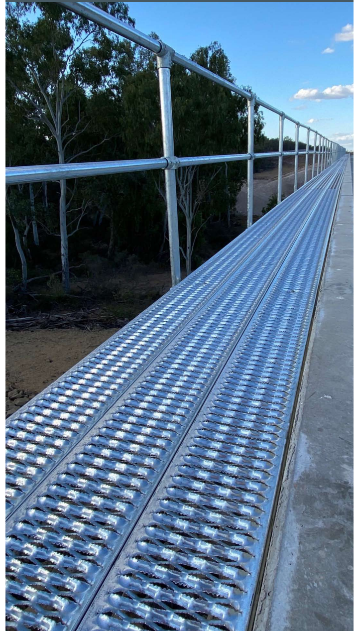
Charmichael Rail Regional QLD 4.2 kms Rail Maintenance Walkway supplied

Gripspan – roll formed plank design enables greater unsupported spans compared to traditional industrial flooring