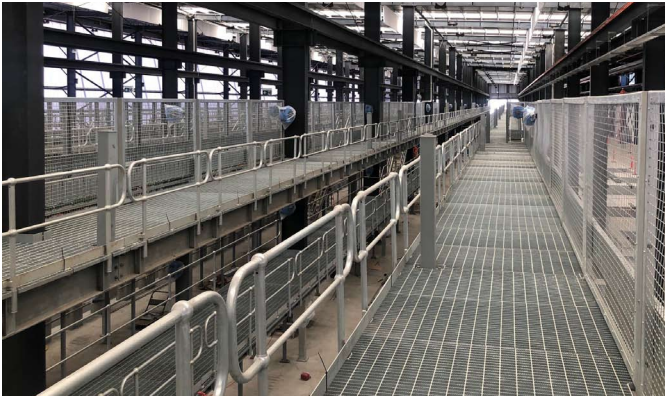
Kangy Angy Rail Maintenance Facility NSW