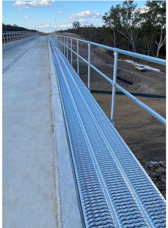
Rail Maintenance Walkways for Bridge Structures

Keep your project simple by selecting from our range of Rail specific pre-engineered proprietary systems.