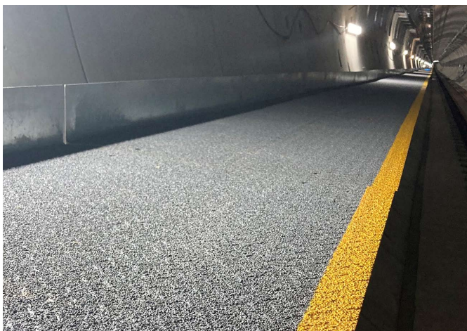
Rail Detrainng Walkways for Tunnels