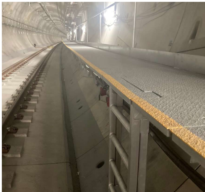
Forrestfield Tunnel Perth 14 kms Rail Detraining Walkway supplied

Gripspan – roll formed plank design enables greater unsupported spans compared to traditional industrial flooring