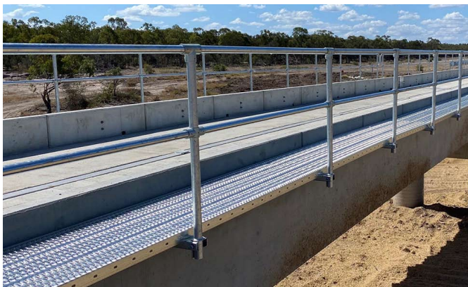
Carmichael Rail Regional QLD