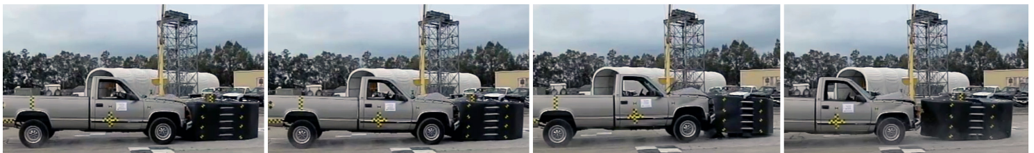
2000kg Pick-up truck impacting head-on with a pole using the RAPTOR™ at 50kph