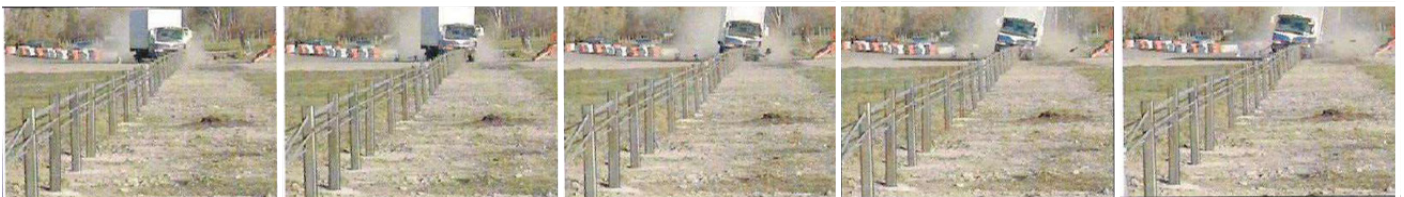
8000kg Vehicle, 80kph, 15° Re-directive Impact on the Armorwire TL-4, 4 Cable Barrier